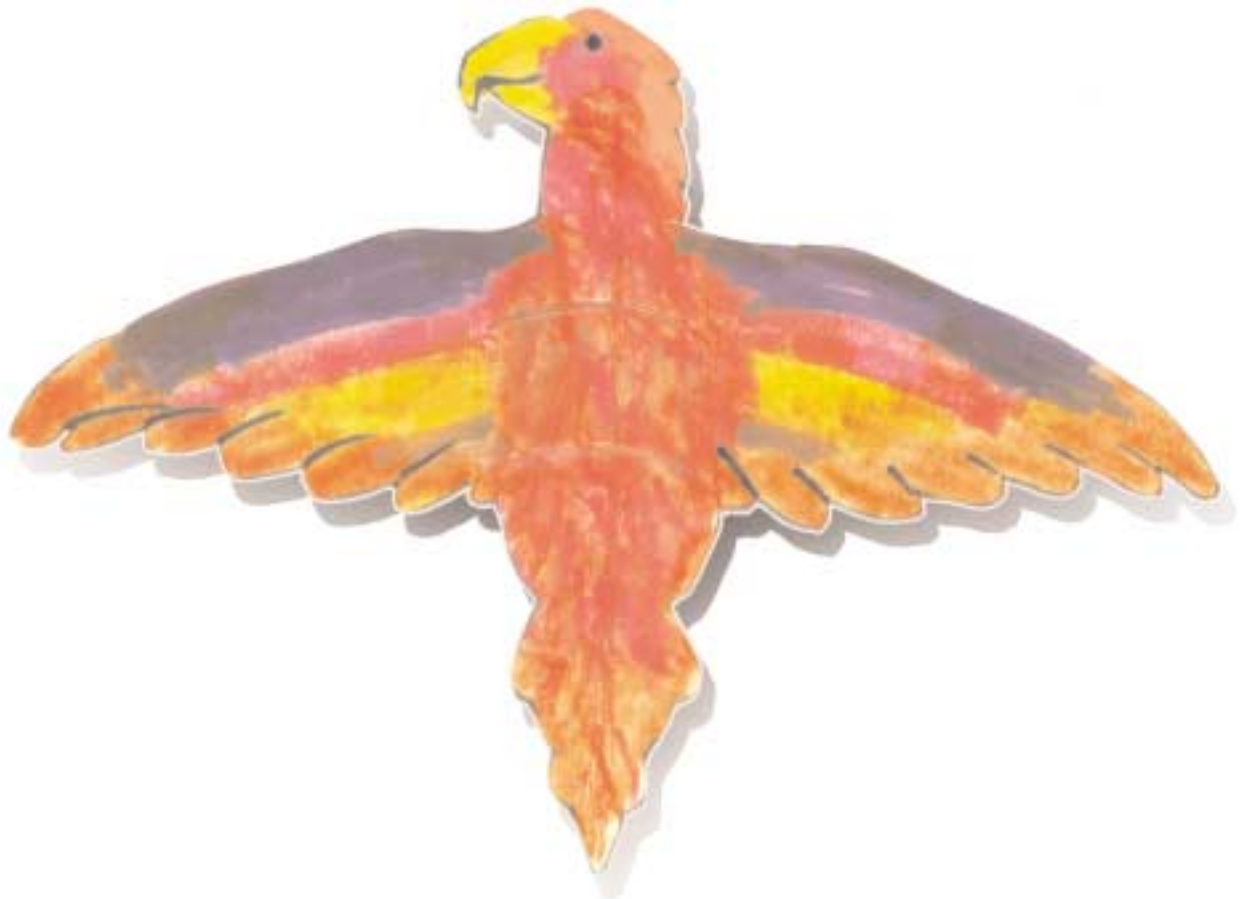
An example of one student's finger puppet parrot.